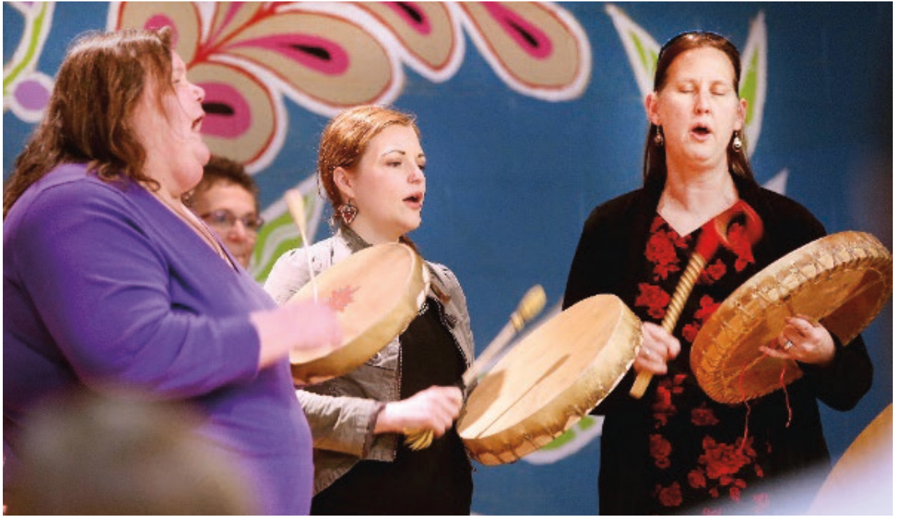
The Oshkii Giizik Singers in a Red Shawl Ceremony, part of a community gathering at the start of Sex Trafficking Awareness Month (January 2017).

Named after an Ojibwe phrase that translates as “we are, all of us together, beginning a good life” Gimaajii-Mino-Bimaadizimin is a community center and 29 units of permanent supporting housing for Native American women and children in downtown Duluth, Minnesota. Many people make up that “we” in Gimaajii, a 50,000-square-foot historic YWCA building, now housing 32,000 square feet of permanent supportive housing, restored and repurposed by the American Indian Community Housing Organization (AICHO). AICHO’s commitment to cultural organizing includes culturally specific programming for residents and other community members. At Gimaajii, this programming happens not only formally in its two art galleries and rooftop garden; Native American culture also permeates every corner of Gimaajii in more subtle ways, from the music on the lobby’s speakers to the smell of sage that wafts through the building.